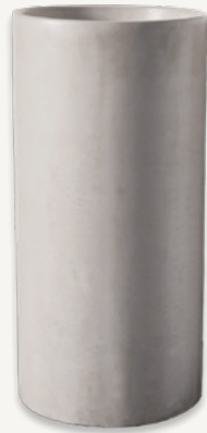
LUNA FREESTANDING BASIN