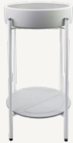
BOWL BASIN STAND