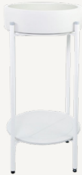
HOOP BASIN STAND