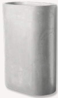
MOLLI FREESTANDING BASIN