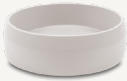
PRISM CIRCLE BASIN