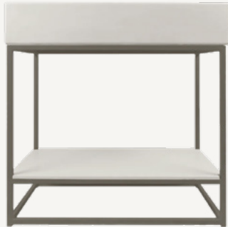
TROUGH BASIN VANITY SET