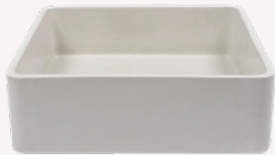
VESL SQUARE BASIN